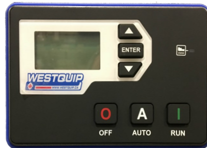
OPTIONAL AUTO-START PANEL UPGRADE